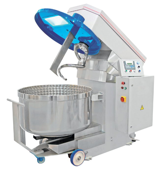
Kneading machine for the food industry