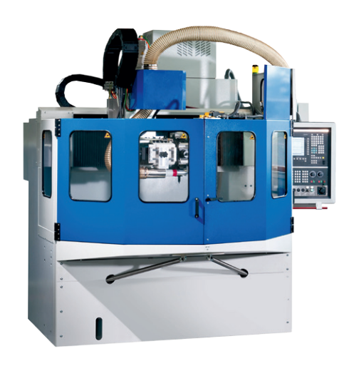
Freudenberg Xpress CNC-machine